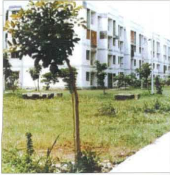
Nerul : 384 DUs Completion Year : June, 1996