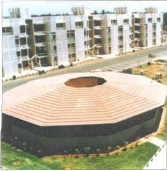
Chennai, Ph-I : 524 DUs Completion Year : October, 1995