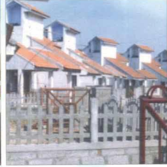
Kochi : 43 DUs Completion Year : June, 2011