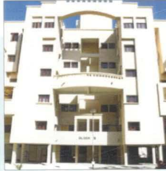
Hyderabad, Ph-I : 344 DUs Completion Year : July, 2001