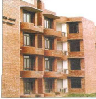
Panchkula, Ph-I : 98 DUs Completion Year : January, 1997