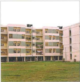
Kolkata, Ph-I : 576 DUs Completion Year : October, 1997