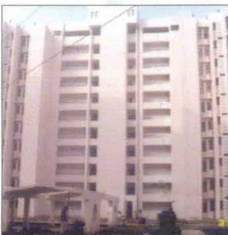
Mohali, Ph-I : 630 DUs Completion Year : April, 2013