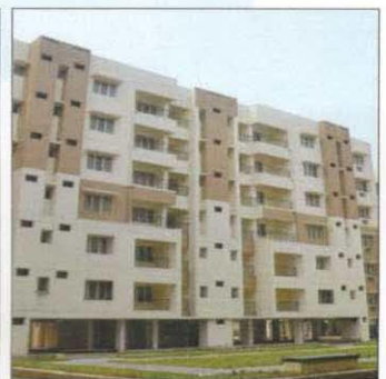
Kolkata, Ph-II : 582 DUs Completion Year : November, 2014