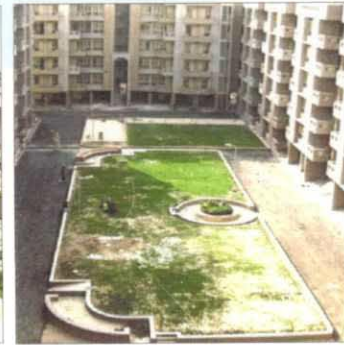
Noida, Ph-IV : 720 DUs Completion Year : February, 2005