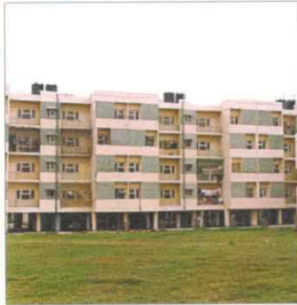
Bangalore : 603 DUs Completion Year : March, 2001