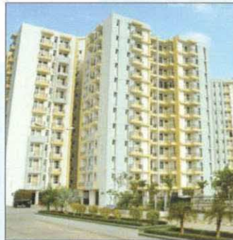
Jaipur, Ph-II : 572 DUs Completion Year : March, 2012