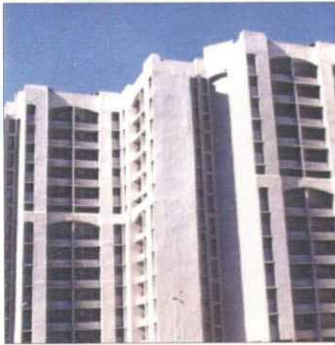
Kharghar : 1230 DUs Completion Year : September, 1998