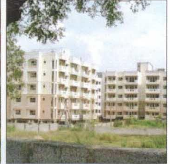
Hyderabad, Ph-II : 178 DUs Completion Year : February, 2006