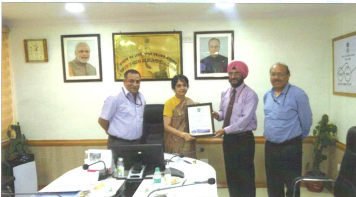
Presenting ISO 9001:2015 Certificate to Secretary M/o Housing & Urban Poverty Alleviation Govt. of India and President Governing Council