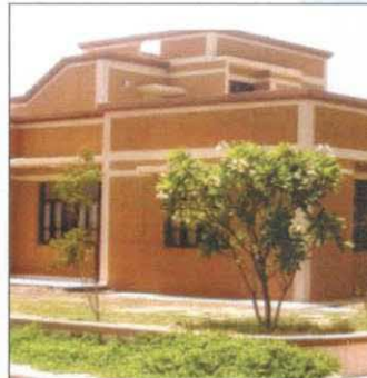
AMIT, Ph-II : Completion Year : March, 2007