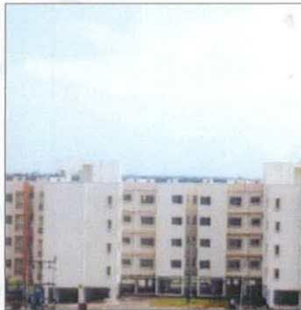
Chennai, Ph-II : 572 DUs Completion Year : February, 2012