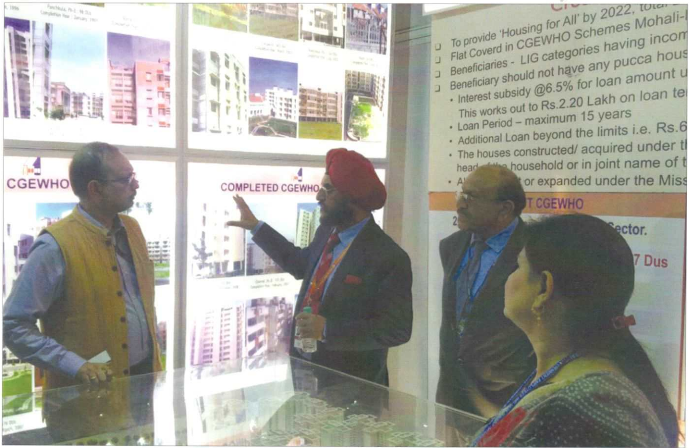
Visit of Joint Secretary (Housing) M/o Housing and Urban Poverty Alleviation Govt. of India and Chairman Executive Committee, CGEWHO to IITF Pragati Maidan 2016