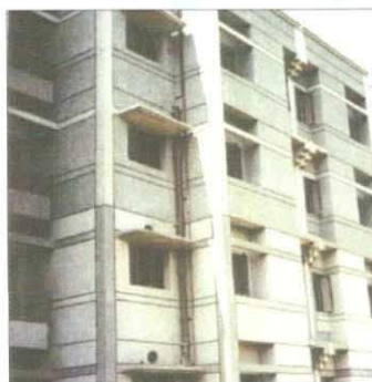
Gurgaon, Ph-II : 852 DUs Completion Year : September, 2002