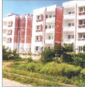
Jaipur, Ph-I : 184 DUs Completion Year : October, 2005