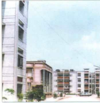
Noida, Ph-II : 508 DUs Completion Year : September, 1998