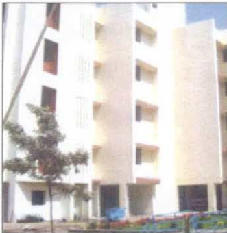
Pune, Ph-II : 148 DUs Completion Year : December, 2008