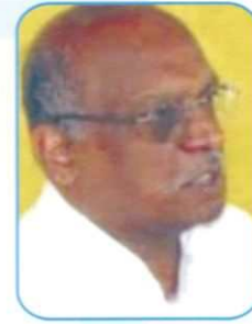
Sh. KKN Kutty National Council (JCM), Member GB/GC