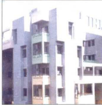
Ahmedabad : 310 DUs Completion Year : October, 2005