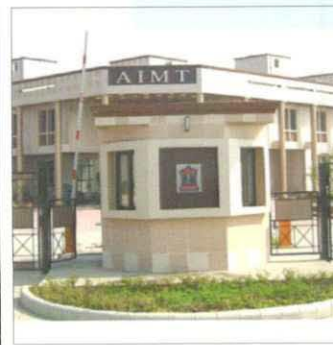
AIMT, Ph-I : Completion Year : March, 2005