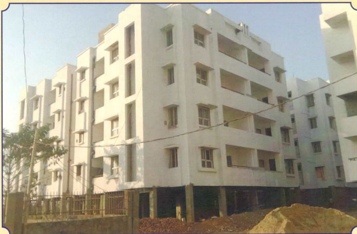
Bhubaneswar Ph II