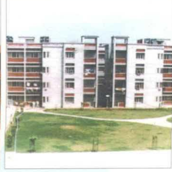
Noida, Ph-I : 692 DUs Completion Year : September, 1997