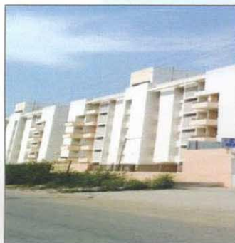
Meerut, Ph-I : 90 DUs Completion Year : December, 2013