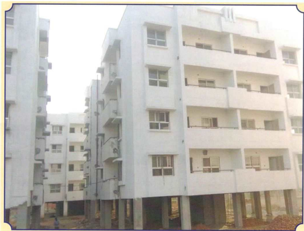
Bhubaneswar Ph-II Project