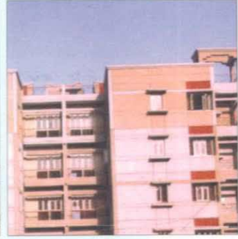
Gurgaon, Ph-I : 1088 DUs Completion Year : July, 1999