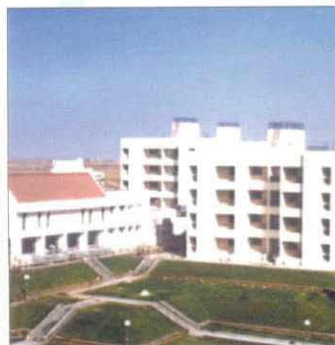
Pune, Ph-I : 159 DUs Completion Year : January, 2003