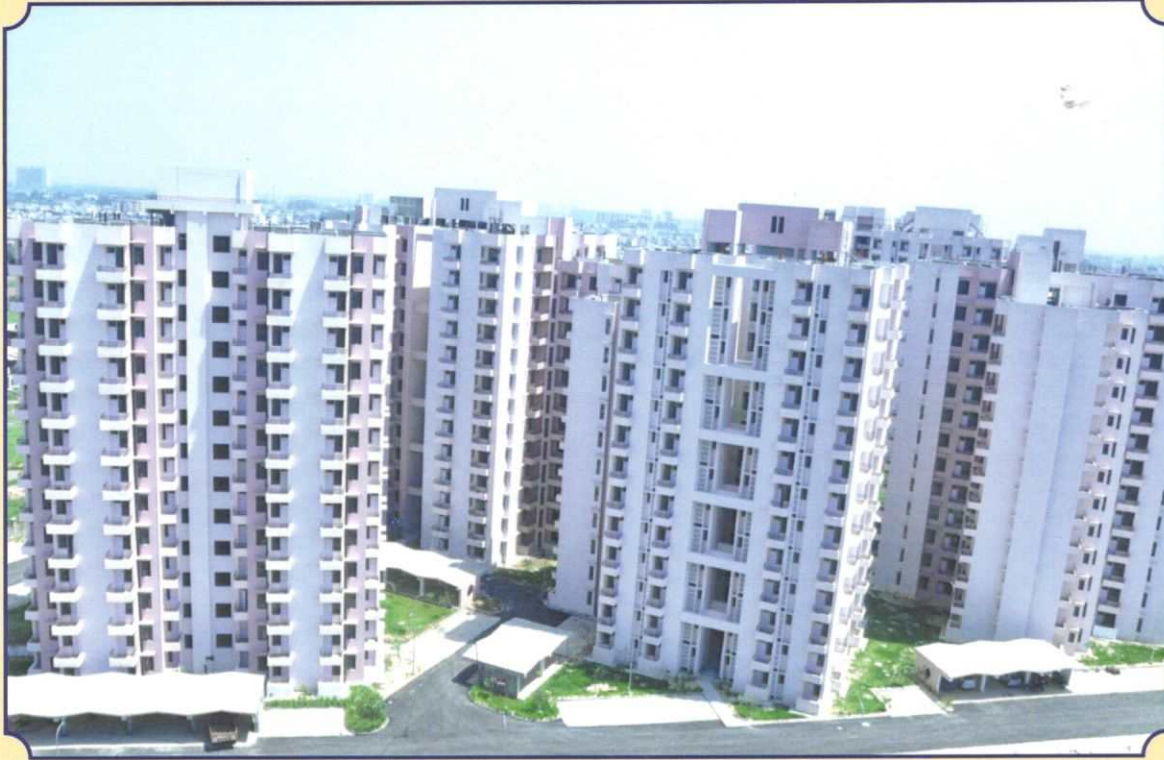
Mohali Ph II