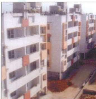
Bhubaneswar, Ph-I : 256 DUs Completion Year : January, 2013