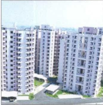
Mohali, Ph-II : 615 DUs Completion Year : 2016