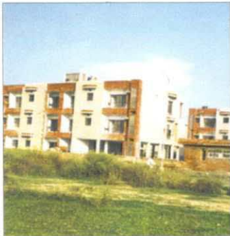
Chandigarh : 305 DUs Completion Year : May, 2000