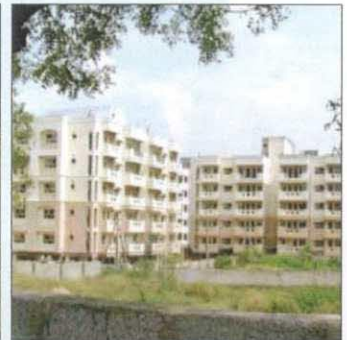
Hyderabad, Ph-III : 380 DUs Completion Year : October, 2012