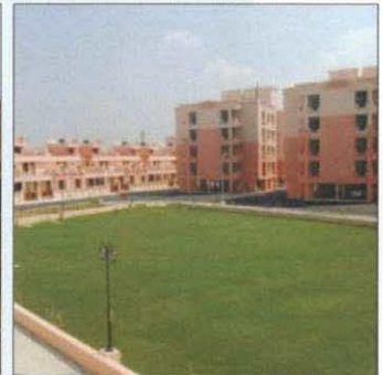
Lucknow : 130 DUs Completion Year : August, 2008