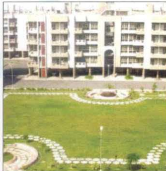
Noida, Ph-V : 576 DUs Completion Year : March, 2007