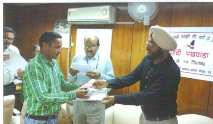
Hindi Pakhwara Celebration and Prize Distribution, September 2016