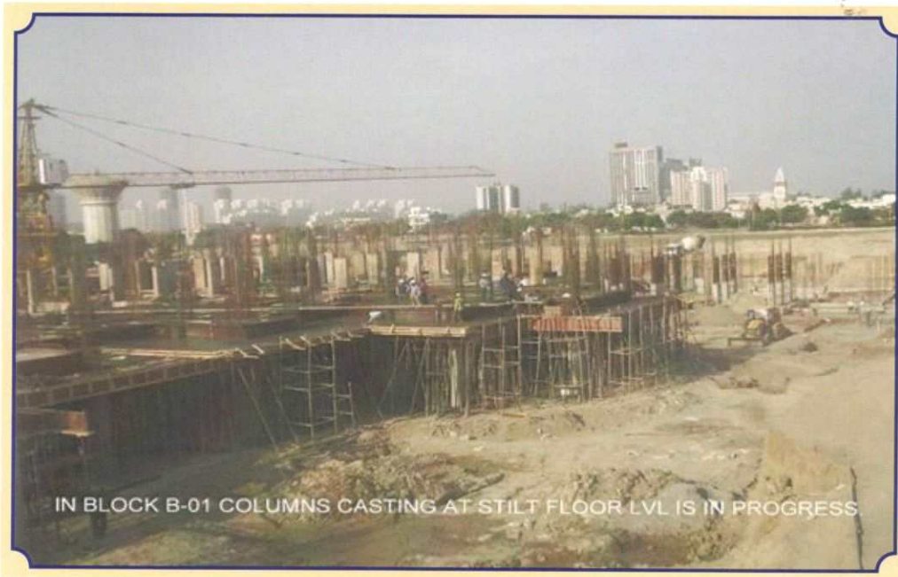
Greater Noida Project