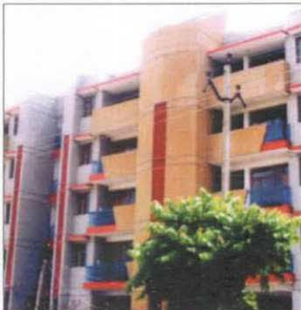
Panchkula, Ph-II : 240 DUs Completion Year : July, 2006