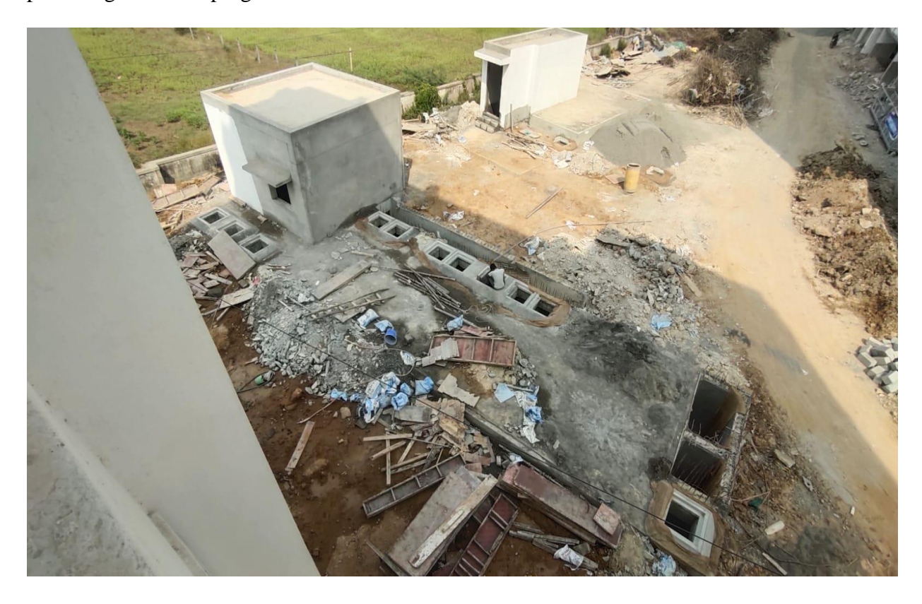
Sewage Treatment Plant 1 (Near C Block). Earthwork excavation works on progress.

Sewage Treatment Plant 2 (Near D Block). All RCC works completed. Internal Water proof plastering works on progress.