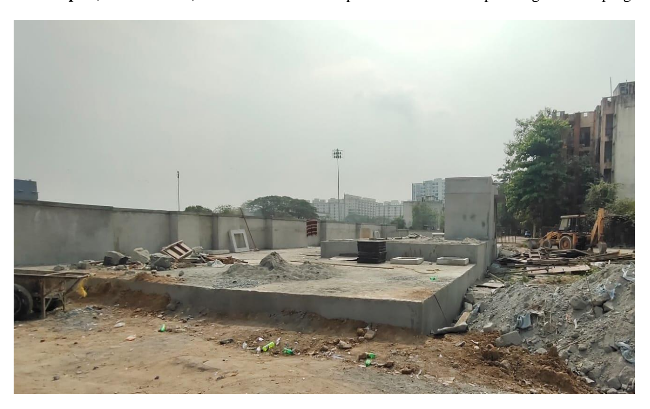
\begin{tabular}{ll} \textbf{U.G Sump 2 (Near D Block)} - \textbf{All RCC works completed. Pump room Inner plastering \& Internal Water proof plastering works on progress. \end{tabular}

U.G Sump 1 (Near B Block) – All RCC works completed. Internal waterproofing work on progress.