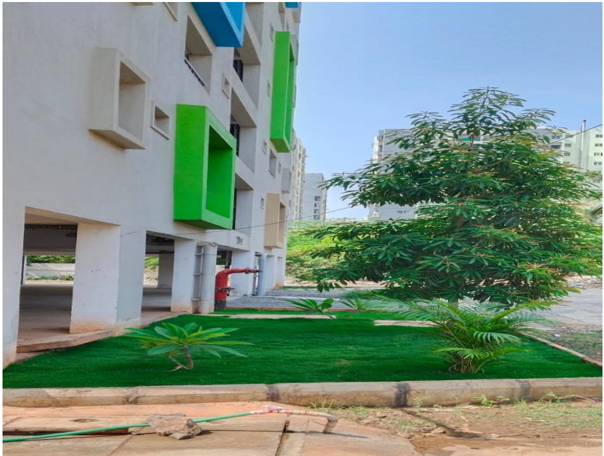
Landscaping work in D2 Block