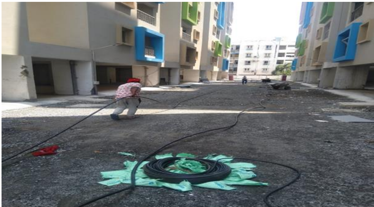
B-2 Electrical Main cabling work is in progress