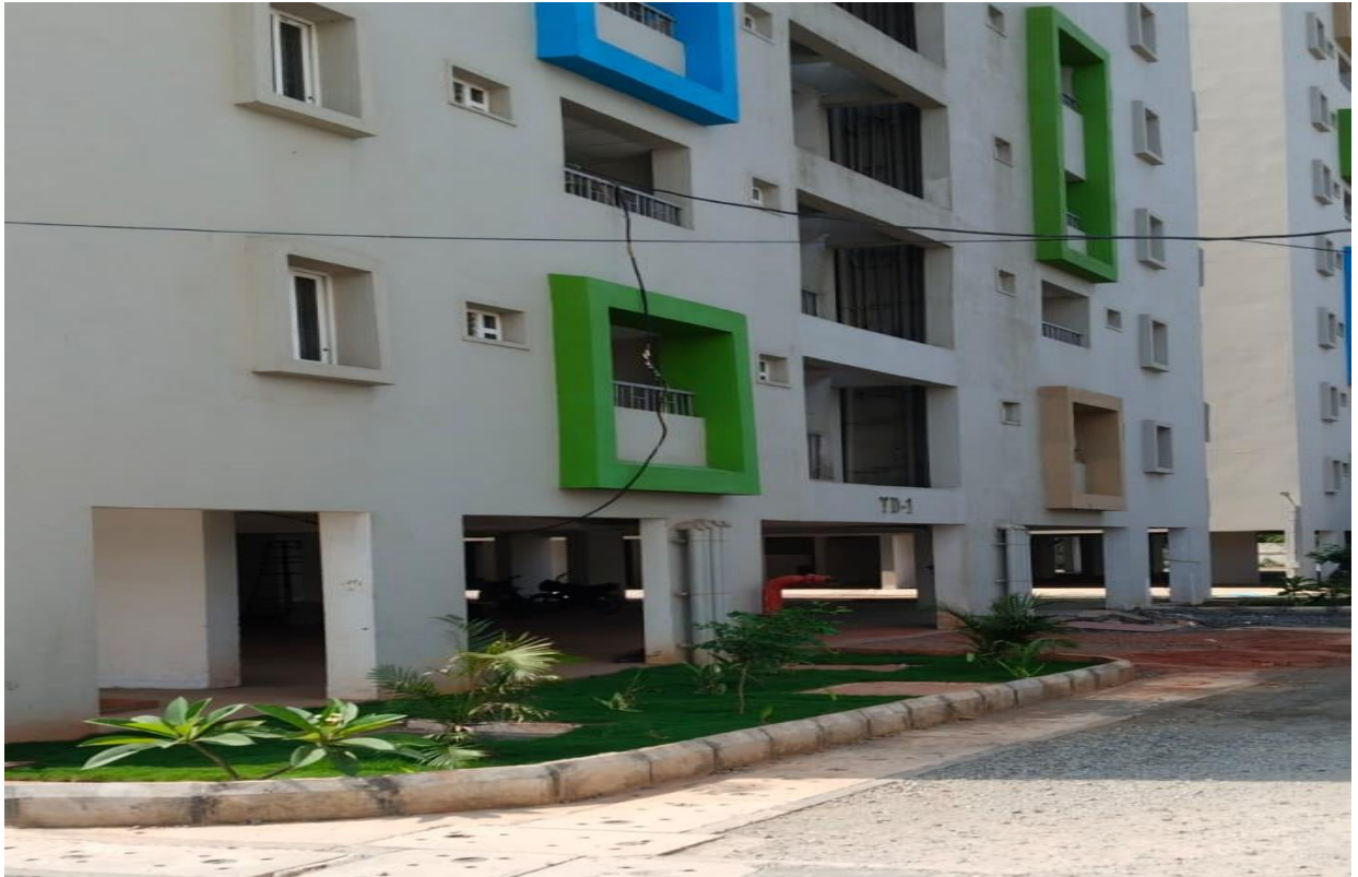
Landscaping work in D1 Block