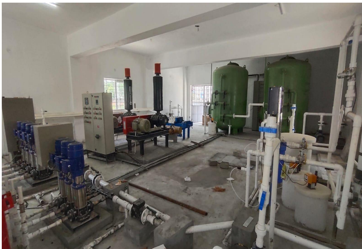
STP-1 – Erection completed & dry testing of components completed