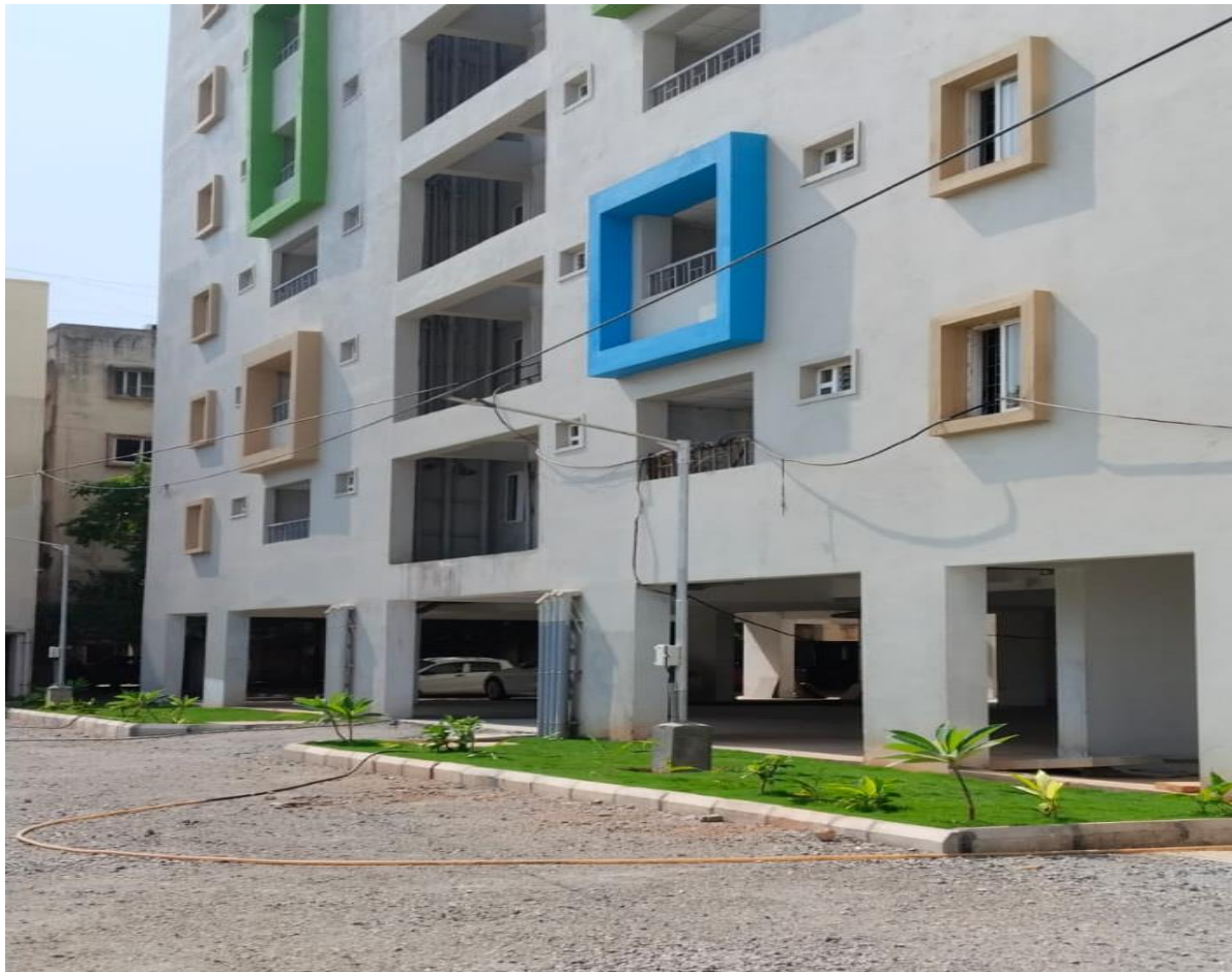
Landscaping work in D3 Block