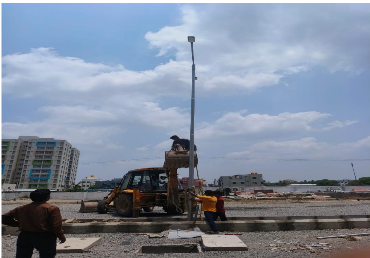
Street light pole fixing work is in progress