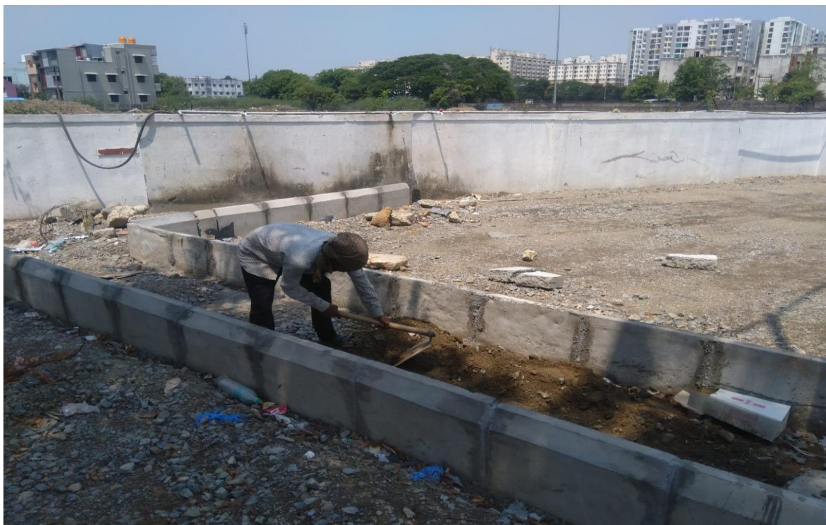
Lawn area and car parking area development work is in progress