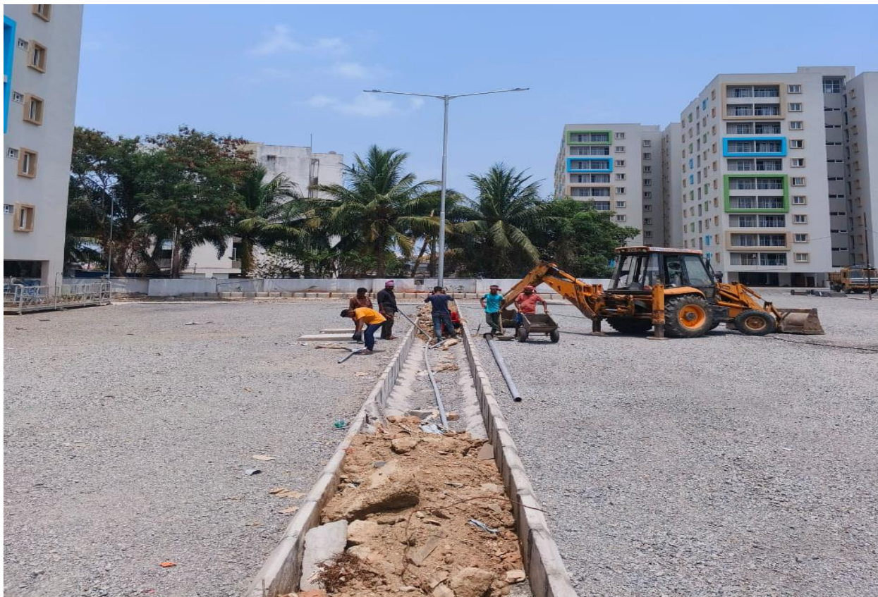
Street light pole fixing work is in progress