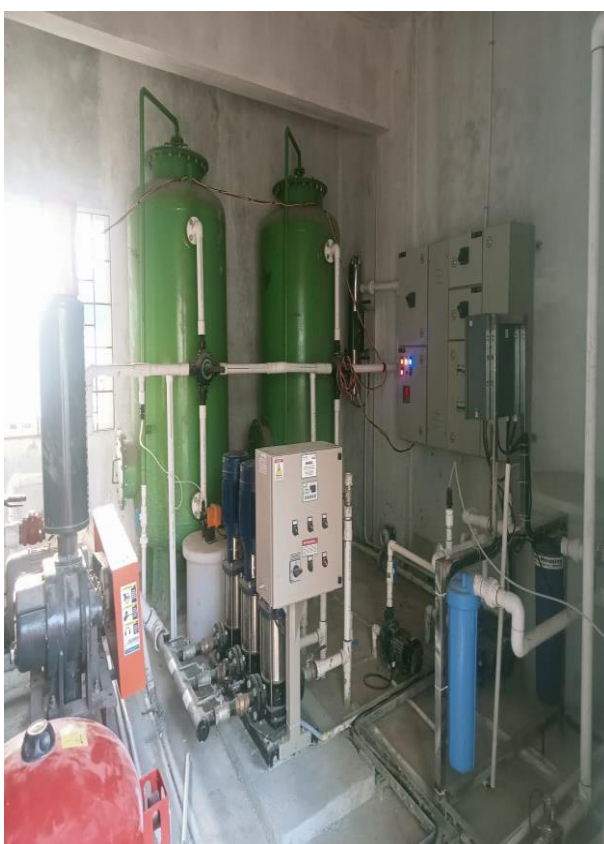
STP-2 – Erection completed & dry testing of components completed